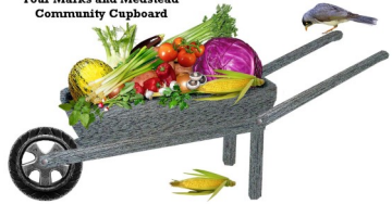
Four Marks and Medstead Community Cupboard

Four Marks and Medstead community Cupboard operates from the Church of the Good Shepherd every Thursday afternoon from 3.45pm- 4.15pm. Come along and save a bag of food from going to waste.