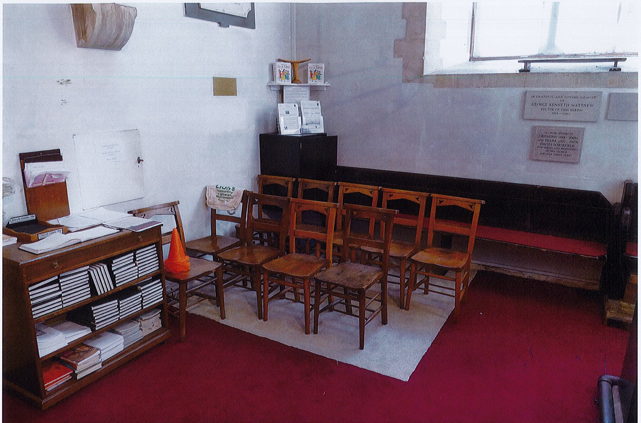
Pews have already been temporarily removed ready for carpeting.