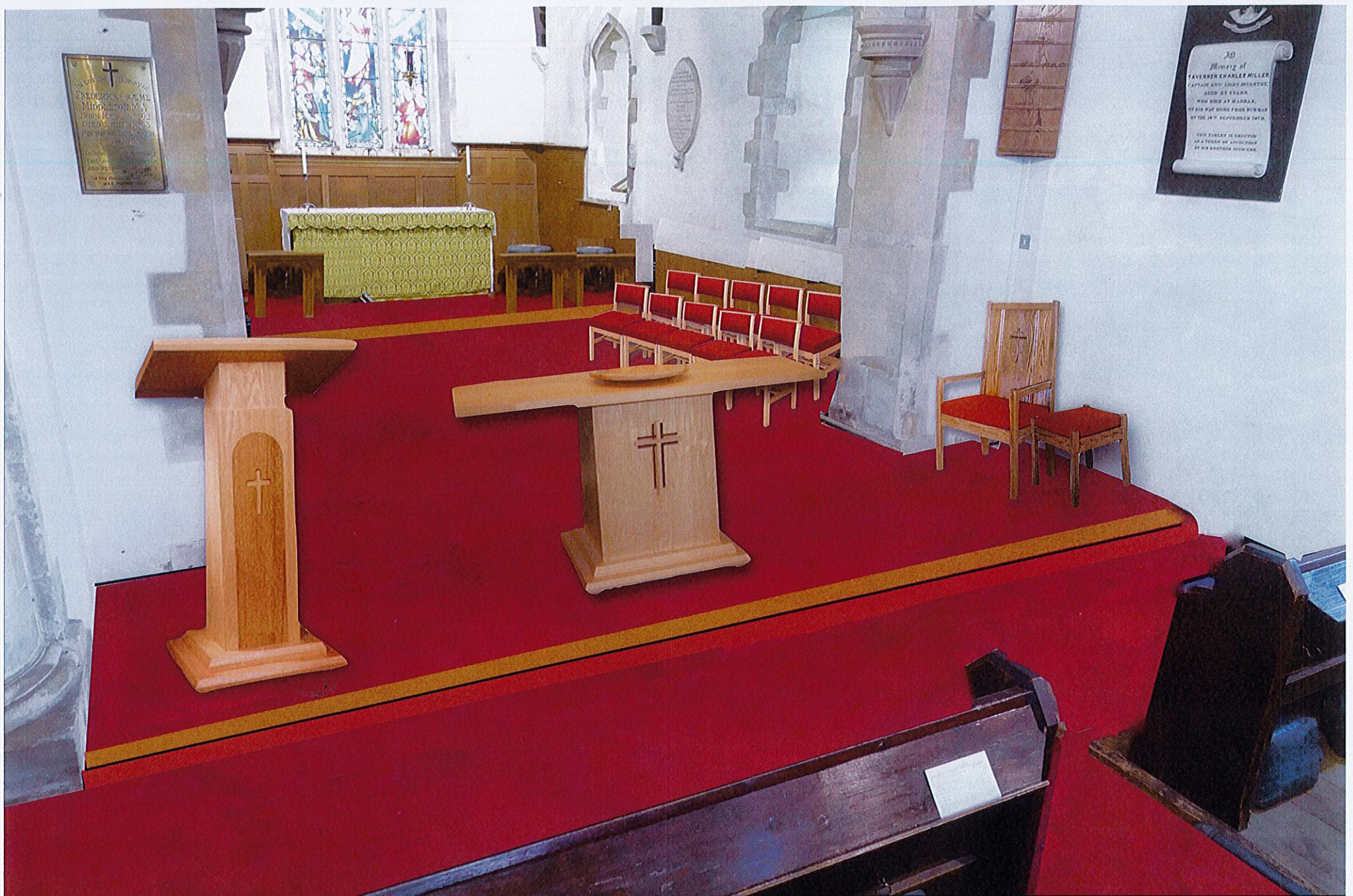
STEP SEVEN: Consider a removable nave altar (allowing space for weddings and funerals) but still using the altar rail at the High Altar.