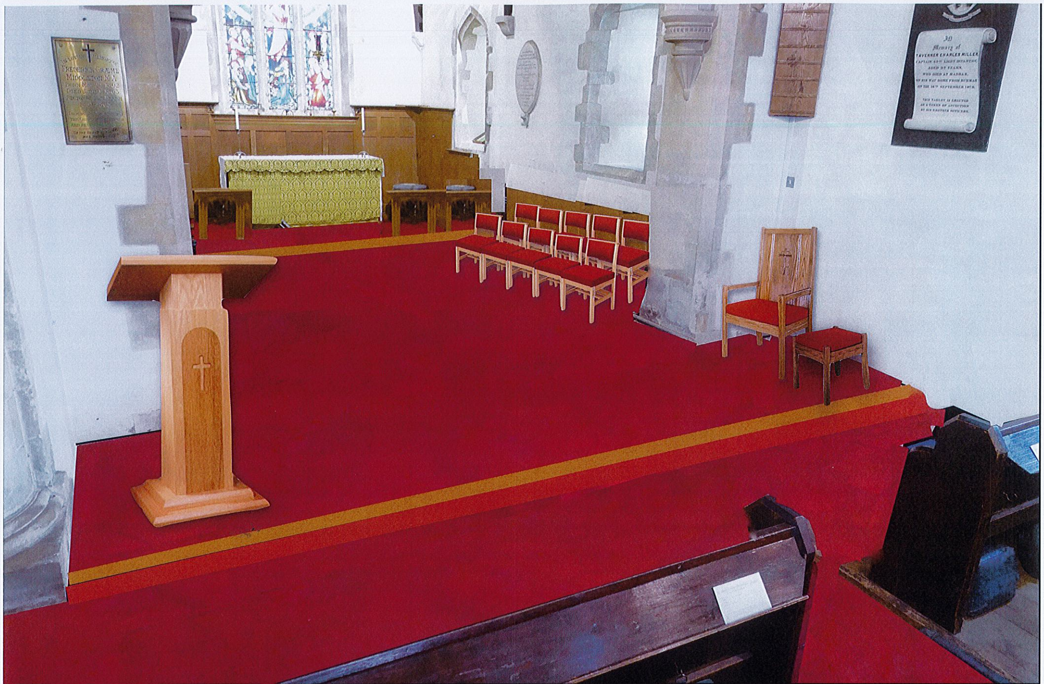
STEP SIX: Provide new lectern, priest's stall and choir chairs for new flexibility in the Sanctuary.