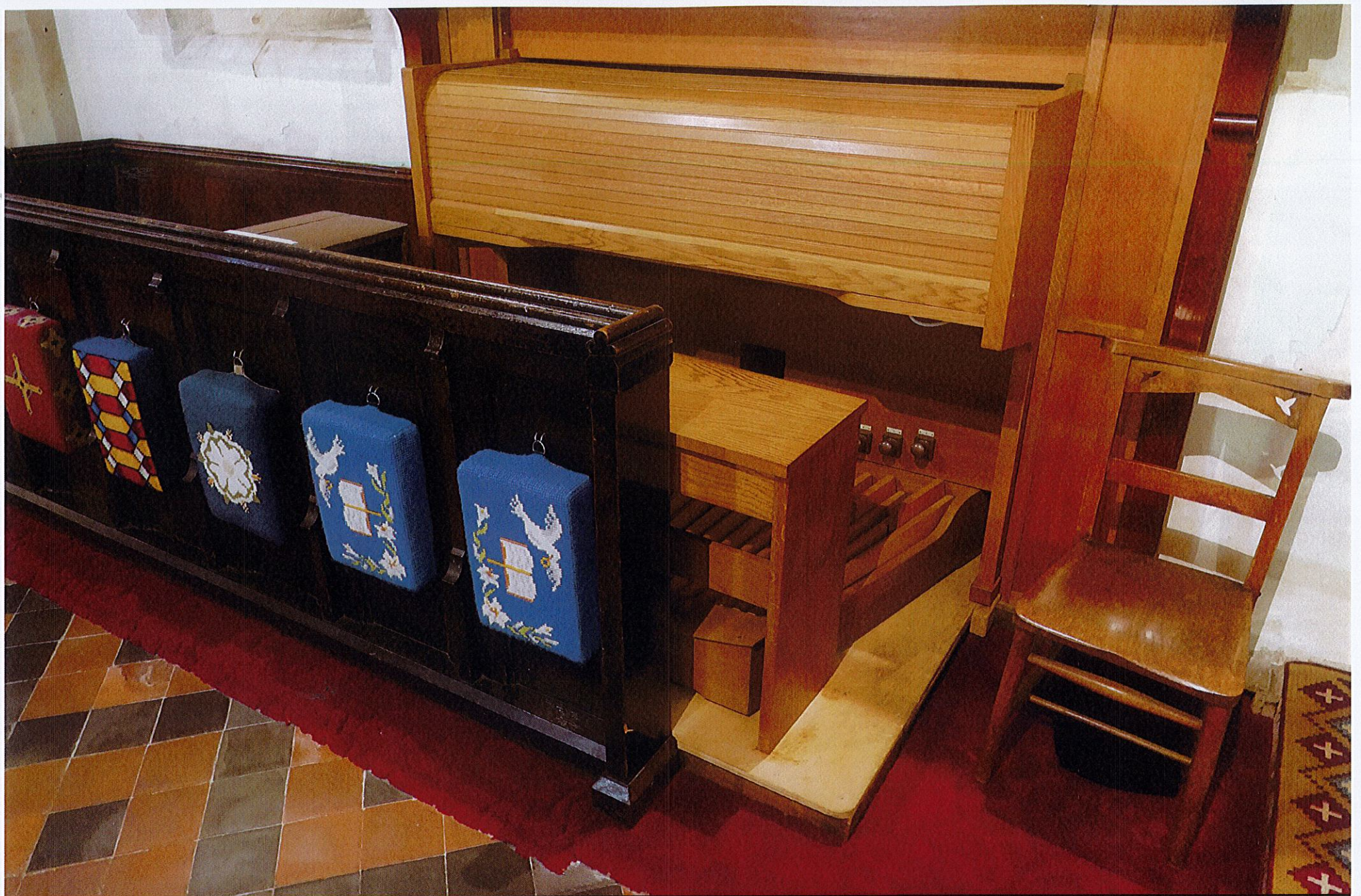
The electric organ is currently raised, but with refurbishment it would be lowered to fit.