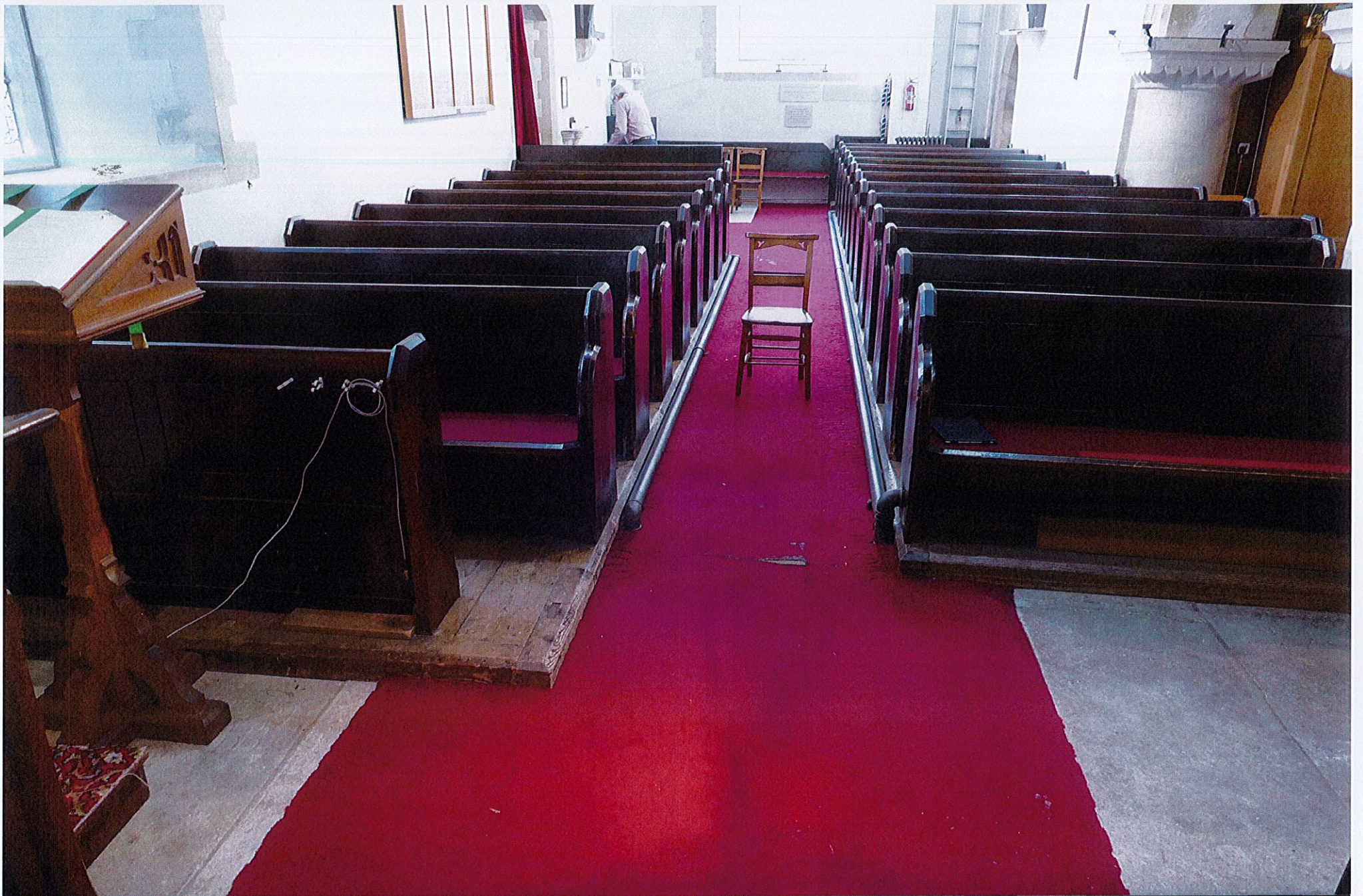
The front south-side pew has a stall that is unused and takes up space.