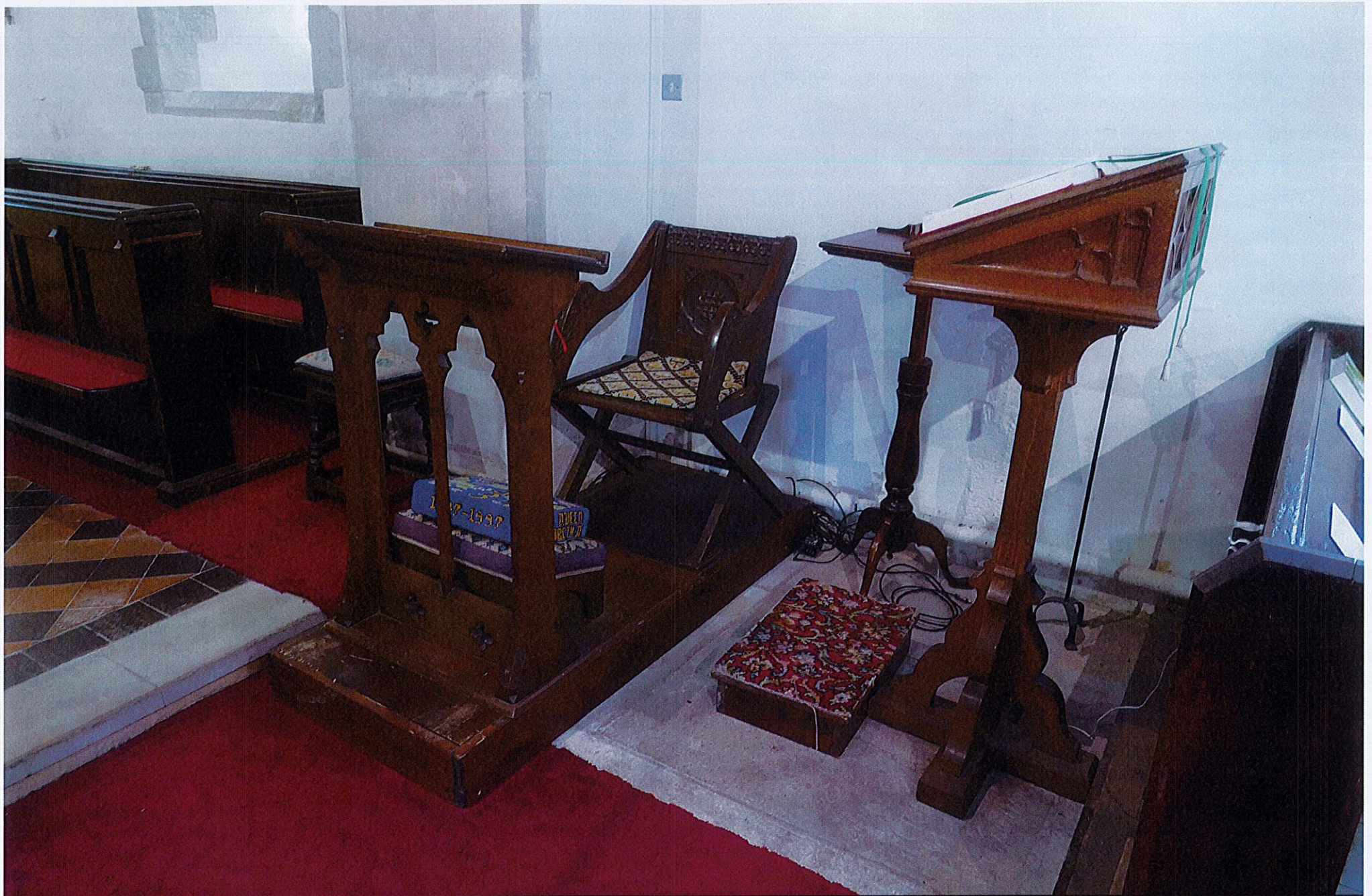
The Priest's stall and the lectern clutter the area and is full of trip hazards.