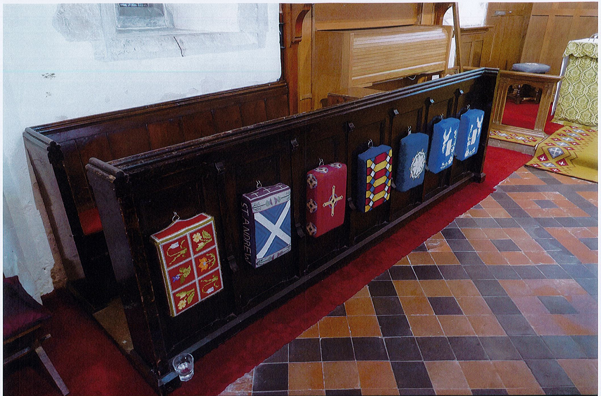
The north side of the Sanctuary is almost unused.