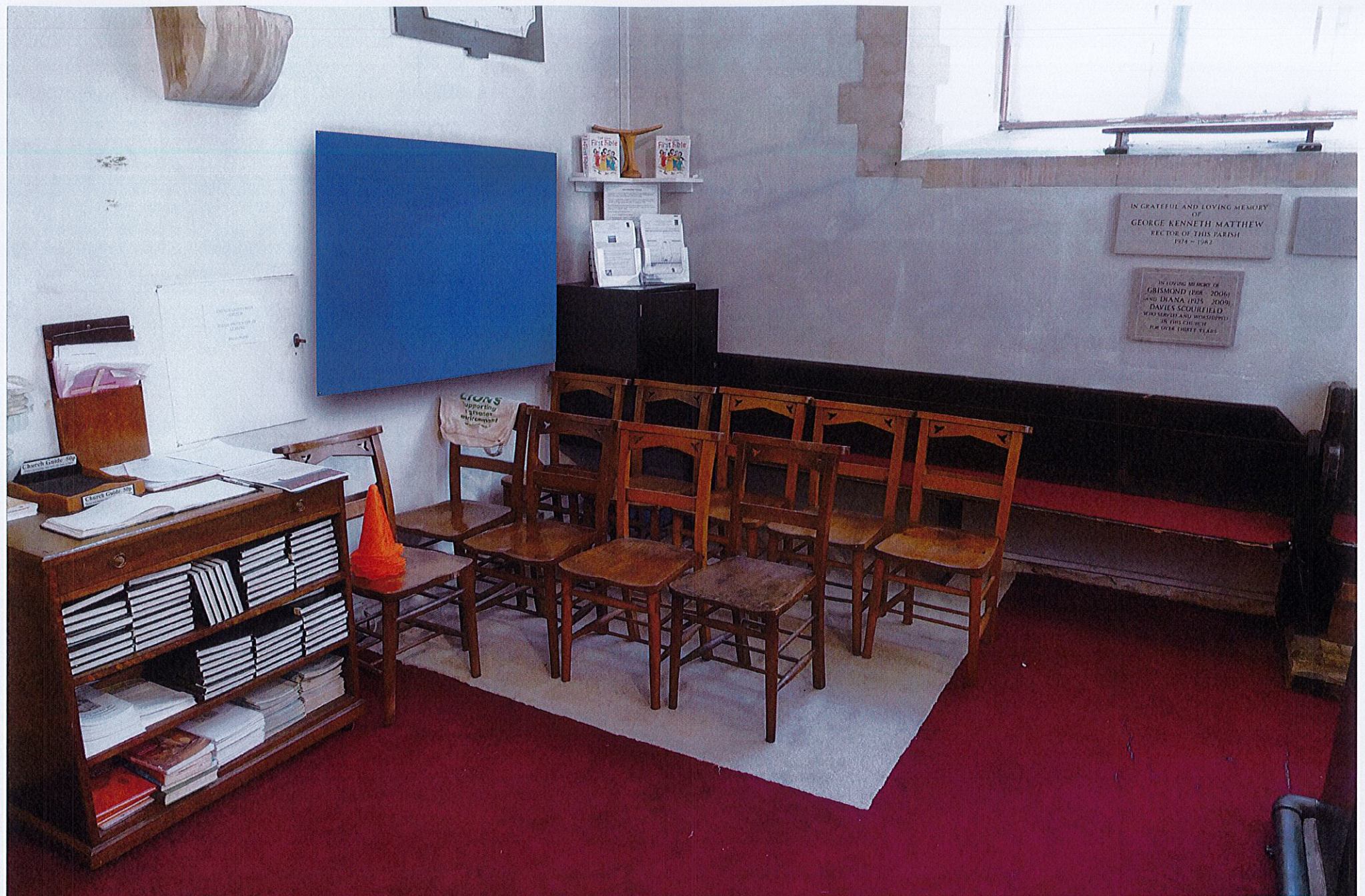
New church noticeboard.