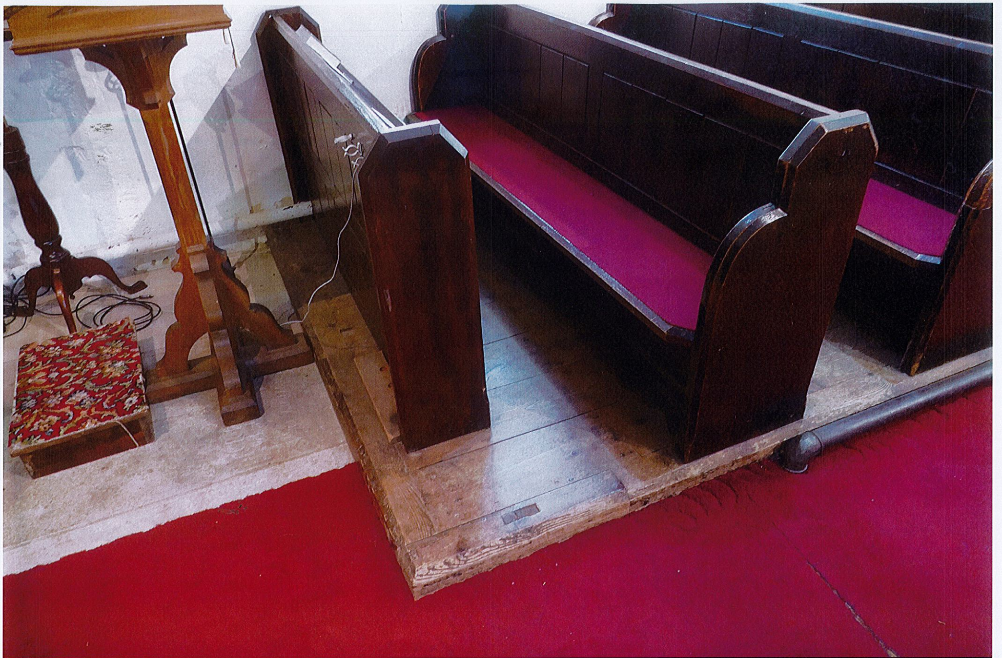
The base needs to be removed along with the front stall.