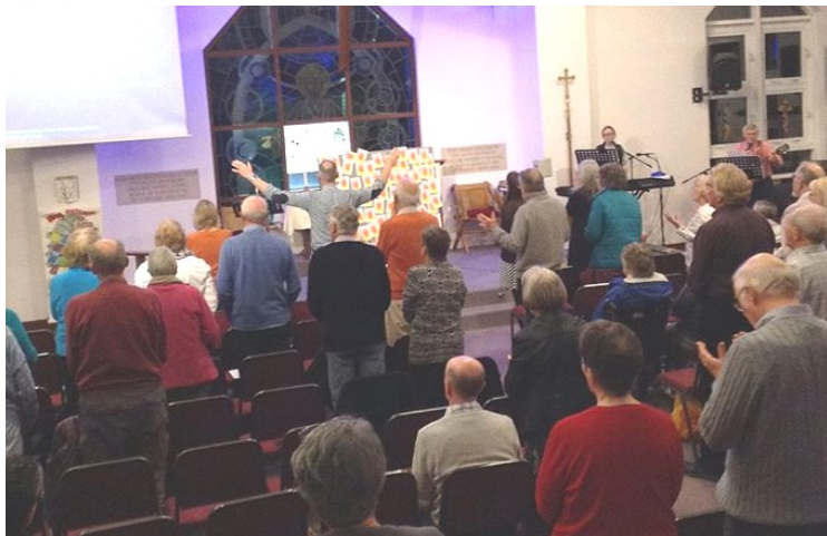
Image from last year's Celebration with APCM

Incorporating the Annual Parochial Church Meeting Please join us!