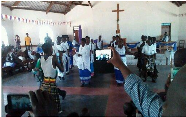
MU members making presentations in the Cathedral

In this quarter, the Mothers' Union members continued to engage themselves in the following activities: